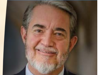
Dr. Scott Hahn