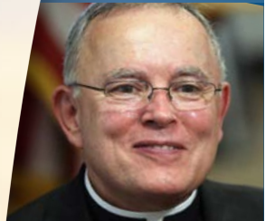
Archbishop Charles Chaput