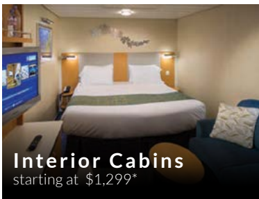
Interior Cabins starting at $1,299*

*Itinerary subject to change and final confirmation by the cruise line.