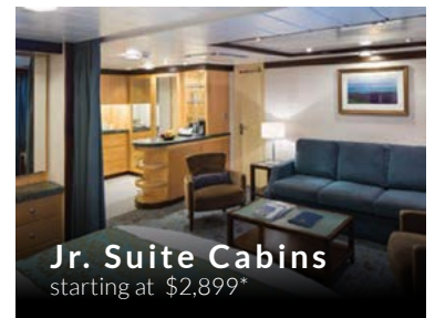
Jr. Suite Cabins starting at $2,899*