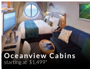
Oceanview Cabins starting at $1,499*